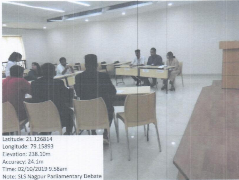
Latitude: 21.126814 Longitude: 79.15893 Elevation: 238.10m Accuracy: 24.1m Time: 02/10/2019 9.58am Note: SLS Nagpur Parliamentary Debate